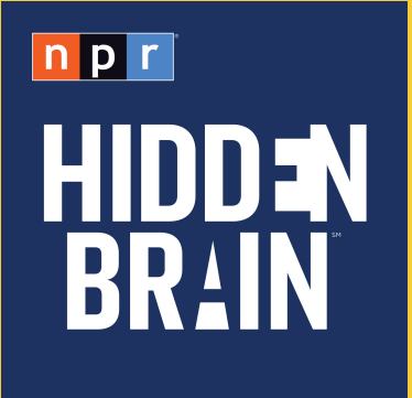
Sundays 2:00 pm