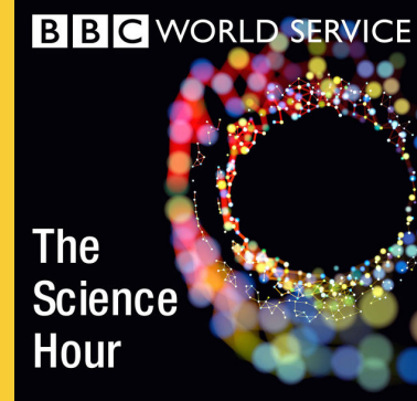
Saturdays 7:00 pm