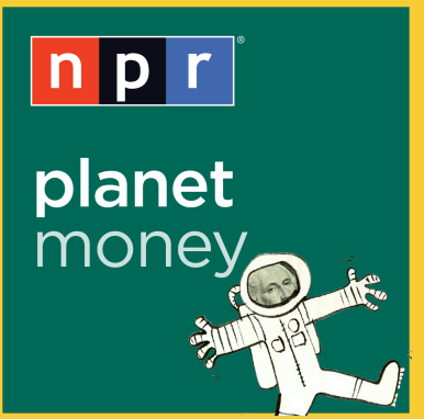
Saturdays 1:00 pm