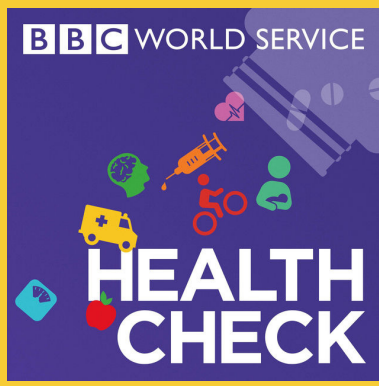
Saturdays 3:30 am