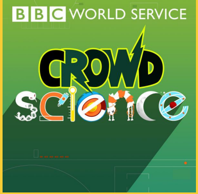
Sundays 3:30 am | 7:30 am | 9:30 pm