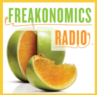
Saturdays 10:00 am