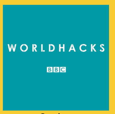
Sundays 7:00 am